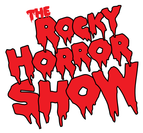
Book Music and Lyrics by RICHARD O'BRIEN

THE VIDEO AND/OR AUDIO RECORDING OF THIS PERFORMANCE BY ANY MEANS WHATSOEVER ARE STRICTLY PROHIBITED.